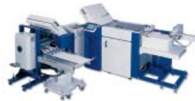
NET 52/4/4/MS 45