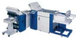
NET 52/4/4 SKM 36