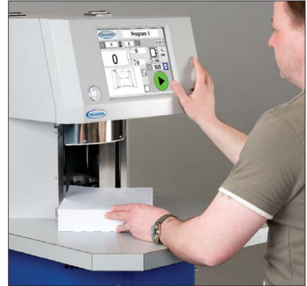
Benchtop Vicount 3 showing colour touch screen.