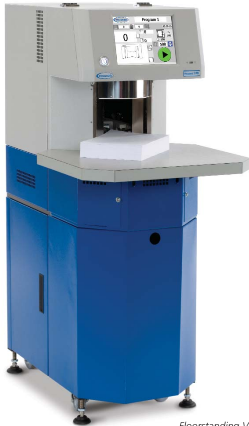
Floorstanding Vicount 3 with small table.

From the basic benchtop machine to the top-of-the-range industrial version, from gift wrap to tax stamps, Vicount 3 is already exceeding the demands of clients around the world.