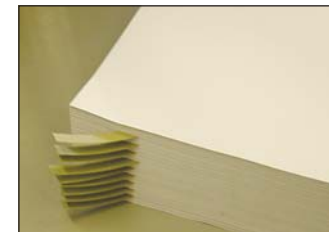
Paper showing inserted tabs.