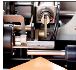
Quick change suction blade.