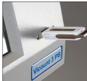
USB data port.