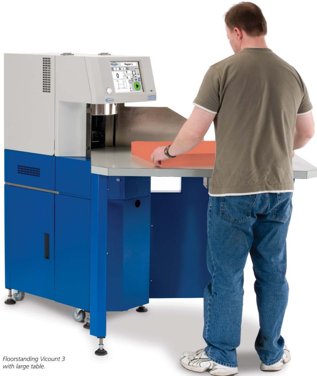
Floorstanding Vicount 3 with large table.