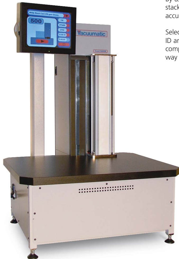
Count-S 450B loaded with credit card hopper.